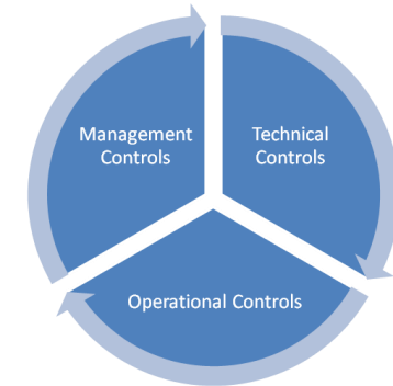
Federal Control Requirements

of Federal requirements that define the physical and logical security control objectives necessary to protect and defend Federal information systems.