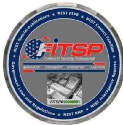
Figure 4: Example of a FITSP Challenge Coin