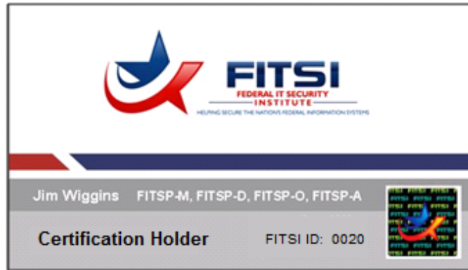
Figure 3: Example of a FITSI ID/Certification Card