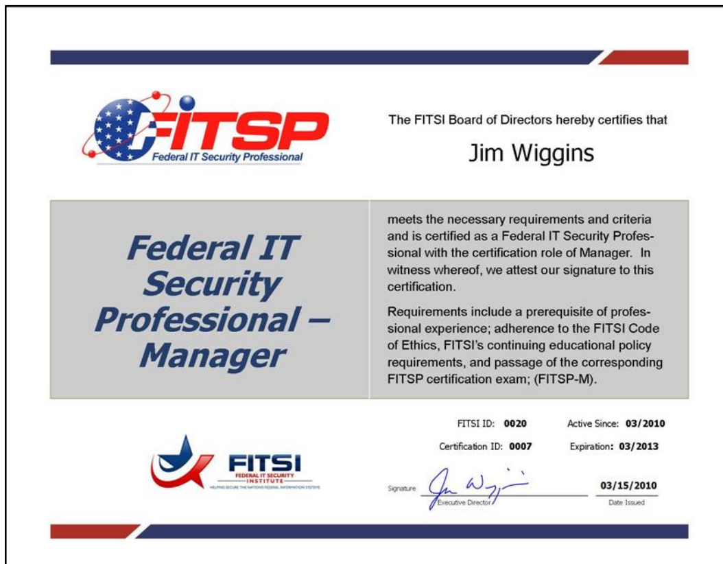
Figure 2: Example of a FITSP-Manager Certification

Examples of a FITSP-Manager Certification, the FITSI ID/Certification Card, and the FITSP Challenge Coin are provided below. Material is similar for Designer, Operator, and Auditor.