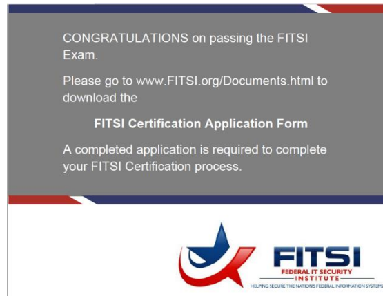
Figure 1: Example of a FITSI Certification Application Card